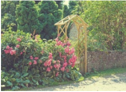
Vertical & Cascading