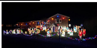
1 st Prize: 14 Chestnut Street