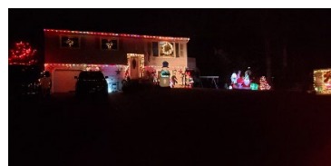
2 nd Prize: 57 Belton Street