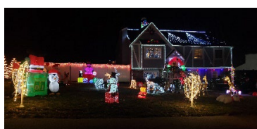
2 nd Prize: 4 Belton Street