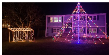
3 rd Prize: 10 Broad Street

Honorable Mentions: 3 Springbrook Rd., 61 River Rd., 7 Ash St., and 20 Lauren Ct.