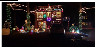
1 st Prize: 32 Mayne Avenue