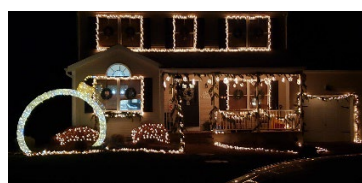
3 rd Prize: 14 River Road